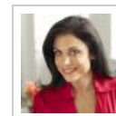
Bethenny Frankel Gets Personal

Dating, Sex, & Love, Relationships, Dating, Sex & Love