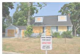
States with the most 'zombie homes'