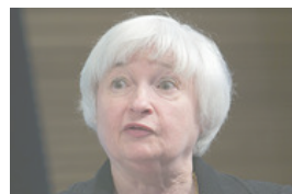
5 top jobs no woman has ever had