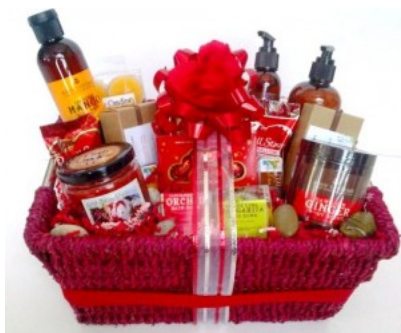
( http://www.lifeisbeautifulgiftbaskets.com/shop/kids-sweet-treats-valentine-gift-basket/ )