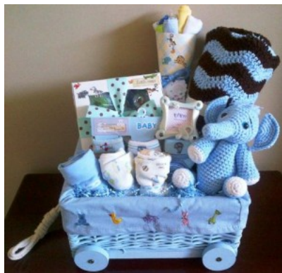
( http://www.calgarygiftbasketreviews.com/wp-content/uploads/2013/05/Sweet-Baby-Handmade-Gift-Basket-Boy-II.jpg )

Today I came across an amazing gift basket website called Life Is Beautiful Gift Baskets. They have unique gift baskets and very reasonable prices for how much you get. The selection includes gift baskets for expecting Mother's, gift baskets for baby boys and baby girls, and even fashionable