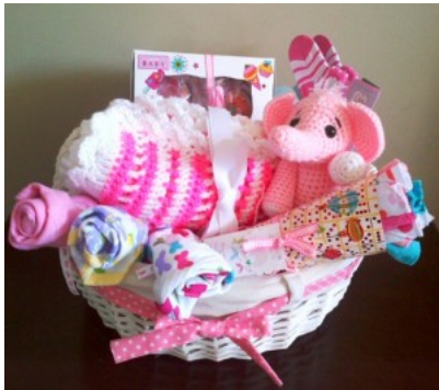
( http://www.calgarygiftbasketreviews.com/wp-content/uploads/2013/05/Sweet-Baby-Handmade-Gift-Basket-Girl.jpg )

Awesome handmade gift baskets for newborn babies at LIFE IS BEAUTIFUL GIFT BASKETS ( http://www.lifeisbeautifulgiftbaskets.com/ )