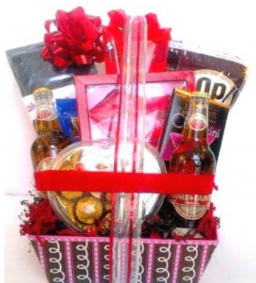
( http://www.lifeisbeautifulgiftbaskets.com/shop/sexy-man-gift-basket/ )