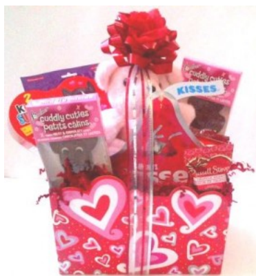
( http://www.lifeisbeautifulgiftbaskets.com/shop/i-love-you-valentine-gift-basket/ ) ( http://www.lifeisbeautifulgiftbaskets.com/shop/every-womans-dream-valentine-gift-basket/ ) ( http://www.lifeisbeautifulgiftbaskets.com/shop/sweet-valentine-gift-basket/ )