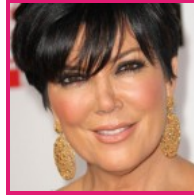
Kris Jenner's Shocking Poolside Photo