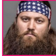
Looks Like 'Duck Dynasty' Is Doomed After All