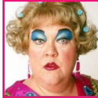
Stars Who've Changed A Lot Since You Last Saw Them