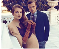
7 Reasons Romantic Relationships Are Overrated