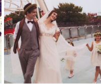
7 Bad Marriage Habits You Should Stop Today