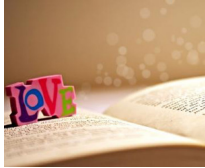
How Not To Let Your Life Revolve Around Your Partner