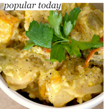
Chunky cauliflower coconut soup