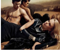
7 Phrases That Will Scare Him If He's Not Serious About Your Relationship