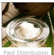
Paid Distribution The Benefits of Vinegar for your Skin (HealthCentral.com)