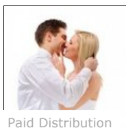
Paid Distribution The Kissing Game: 7 Techniques to Drive Him Wild (MyDailyMoment)