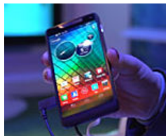
Tips to Ensure Your Business Stays Relevant InformationWeek