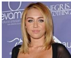
We Can't Help But Stare At Miley Cyrus StyleBistro