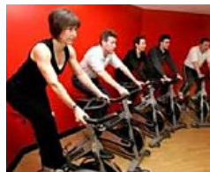
The #1 Exercise that Accelerates AGING (Stop Doing It!) Old School New Body