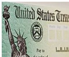
Homeowners Are In For A Big Surprise... Smart Life Weekly