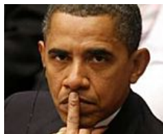
1 Stock Obama does not want you to know about? Invests.com