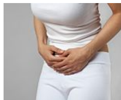
The #1 WORST Food For Your Digestion (Are You Eating It?) Toxic Belly Bug Fix