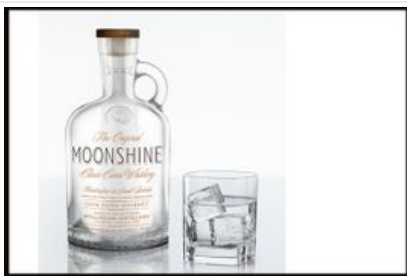
The Original Moonshine, Clear Corn Whiskey by StillHouse Distillery

Moonshine generally applies to high-proof whiskey – generally made with corn, but also use apples or peaches – that is illegally produced. The term originated because the beverage is often made at night by the light of the moon.