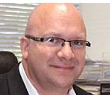
Pastor Mocked for His 'Biblical Money Code,' Gets Last Laugh Moneynews